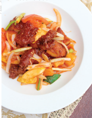
Sweet and Sour