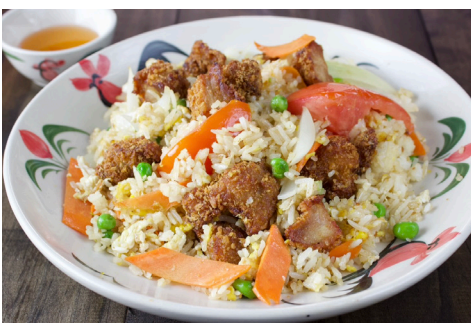
Crispy Chicken Fried Rice